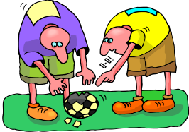
Just kick it Pete