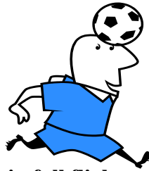
Roger in full flight